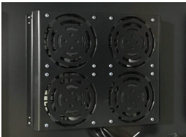
Fan Group as Optional