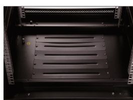
Cable Entrance on Rear Panel