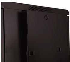
Removable Side Panels