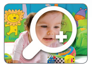
Digital zoom up to 4x from your mobile device